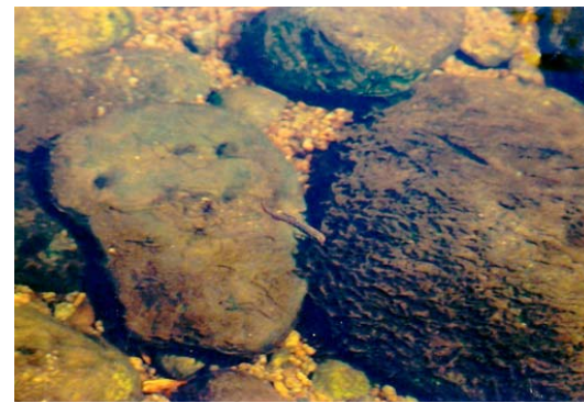
Can you spot the coho salmon fry in this photo?