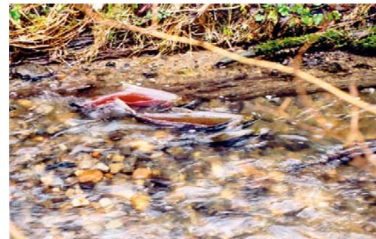
A pair of spawning coho salmon